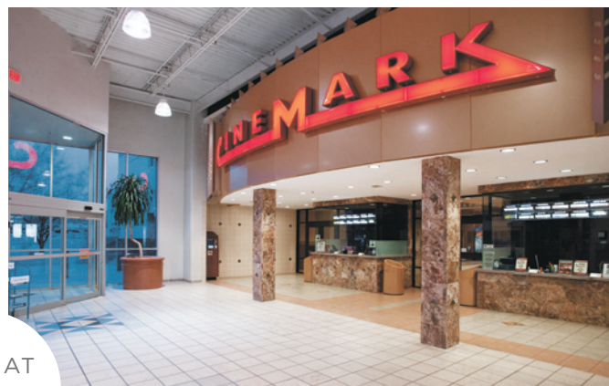
MALL AT SIERRA VISTA